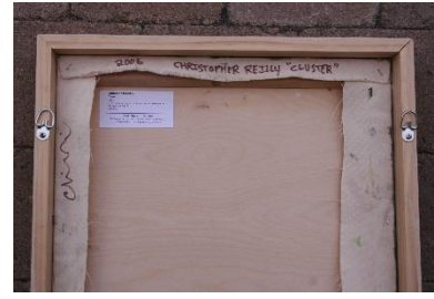
D-rings on either side of frame/canvas also acceptable